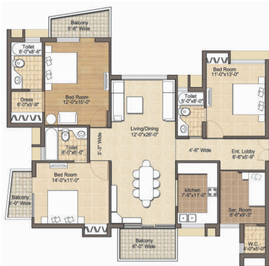
UNIT PLAN TYPE : 1922 sq. ft.

* This is tentative plan subject to approval from the concerned authority