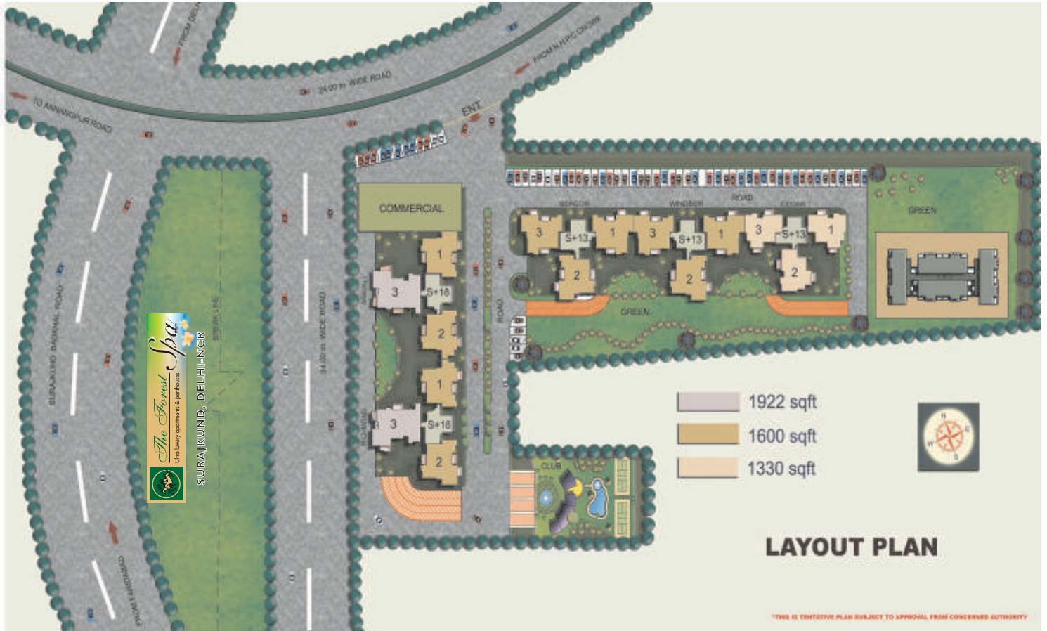
TYPICAL 2 B/R FLOOR PLAN (Saleable Area - 1330 Sq.ft.)