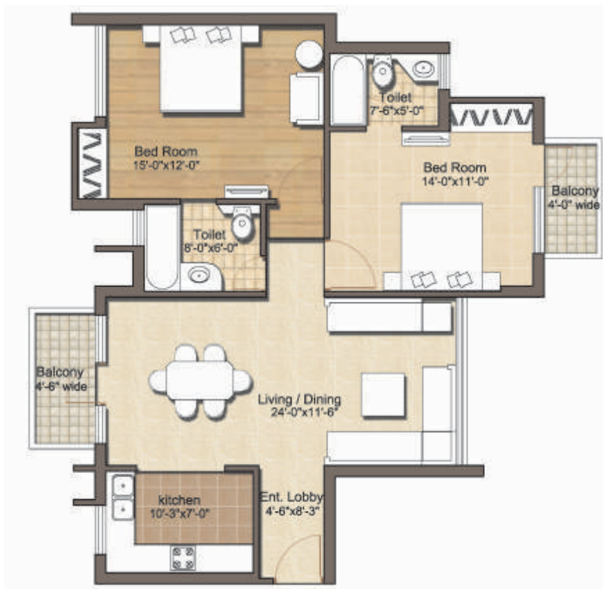
UNIT PLAN TYPE : 1330 sq. ft.