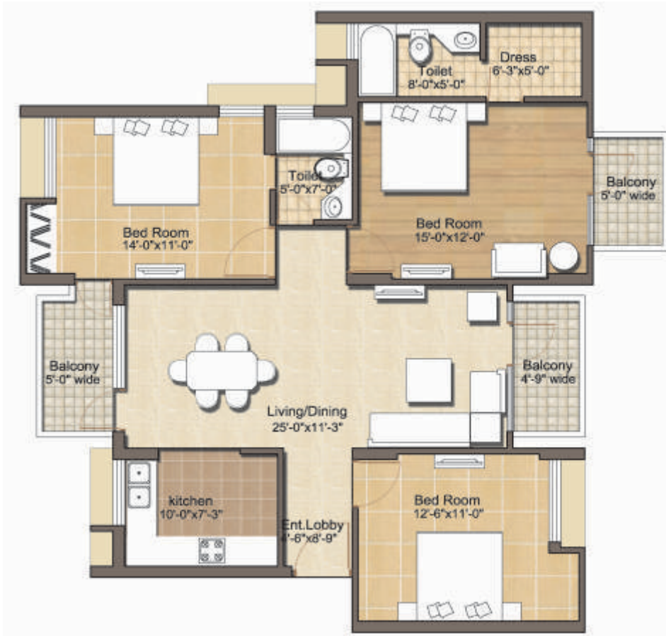
UNIT PLAN TYPE : 1600 sq. ft.

* This is tentative plan subject to approval from the concerned authority