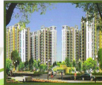
Ozone Park Sec 86, Faridabad