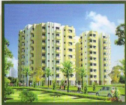
Sai Vatika Tower, Sec 63, Faridabad