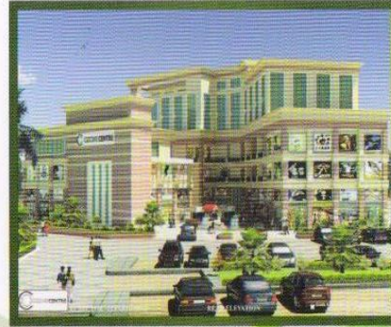
Ozone Centre Sec12, Faridabad