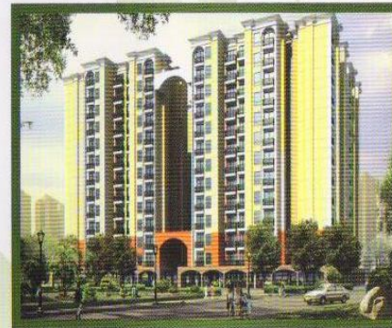
Sai Park, Sec 87, Faridabad