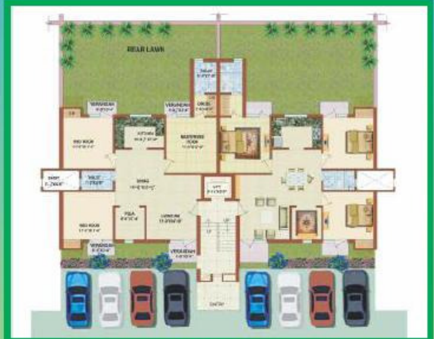
9 M WIDE ROAD GROUND FLOOR PLAN