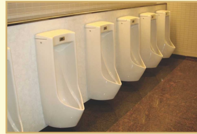
Convenience Utility for Drivers etc.