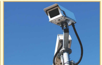
24x7 Hrs. Cut Edge Security