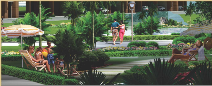
Landscape Garden & Jogging Track