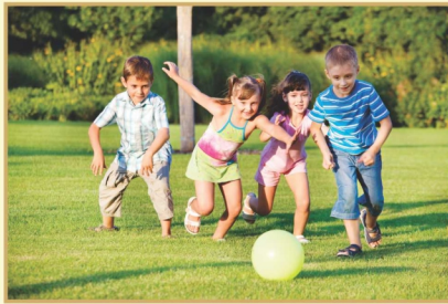
Kid's Play Area