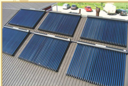
Solar Water Heating System