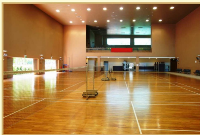
Badminton Hall cum Multipurpose Hall